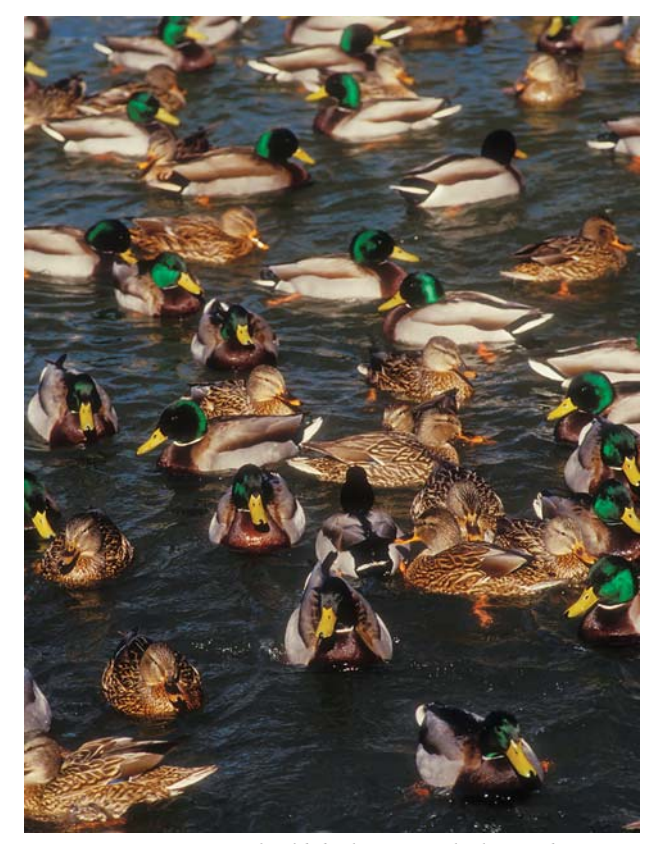
Dense congregations of wild ducks, particularly in urban settings, greatly enhance the chances of disease transmission.

United States Fish and Wildlife Service (www.fws.gov)