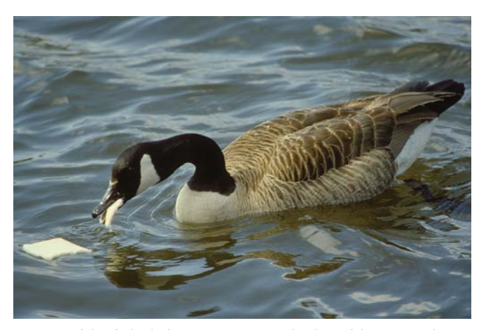
Processed foods lack the nutrients waterfowl need for survival.

Connecticut provides important breeding and wintering habitat for approximately 30 waterfowl species. Our state abounds with numerous coastal and inland areas that are very important to ducks and geese. Connecticut's natural resources provide waterfowl with the proper nutrients they need throughout the year. Waterfowl have evolved to migrate extraordinary distances without the assistance of people. Artificial feeding can delay this natural phenomenon and encourage some birds to overstay their welcome.