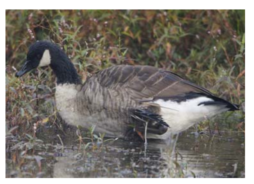
People who feed waterfowl contribute to the birds acquiring numerous physical ailments that result from malnutrition.

private landowners often spend large amounts of money to alleviate problems with waterfowl that are often caused by people