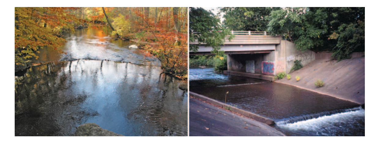
Figure 2. Changes in stream form associated with urbanization.

When increased pollution is added, the combination can be devastating. In fact, many studies are finding a direct relationship between the intensity of development in an area—as indicated by the amount of impervious surfaces—and the degree of degradation of its streams (Figure 3). These studies suggest that aquatic biological systems begin to degrade at impervious levels of 12% to 15%, or at even lower levels for particularly sensitive streams. As the percentage of imperviousness climbs above these levels, degradation tends to increase accordingly.